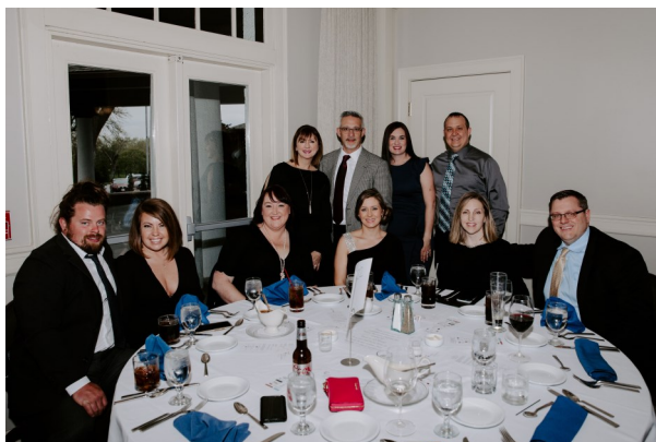
2019 Nebraska CASA Gala—CASA for Lancaster Co. Table