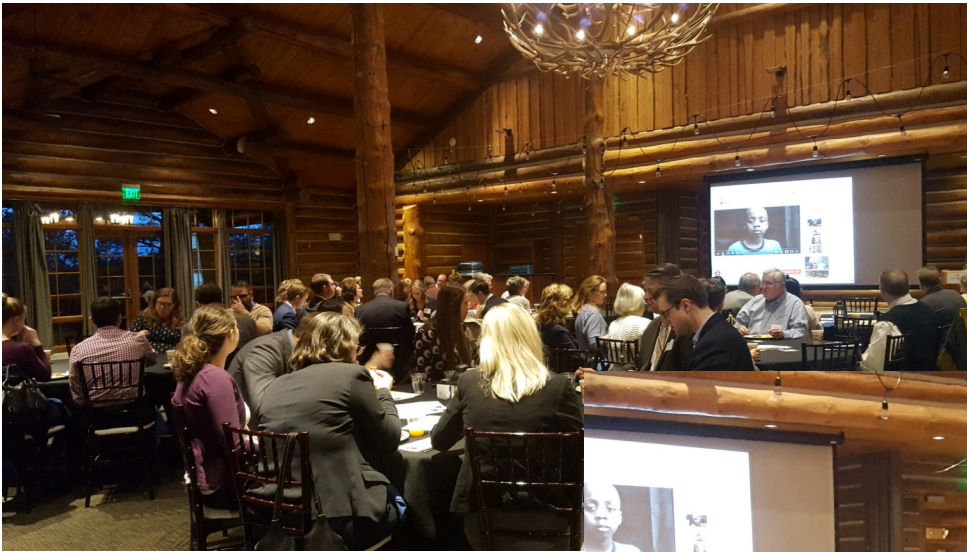
Scenes from 2018-19:

Heroes for Children Fundraiser, Swearing-In New Volunteers, Be The Voice Lincoln 2019 Fundraiser, Holiday In-Service at Chez SoDo and gifts from the CASA Giving Tree at Nebraska Bank of Commerce!